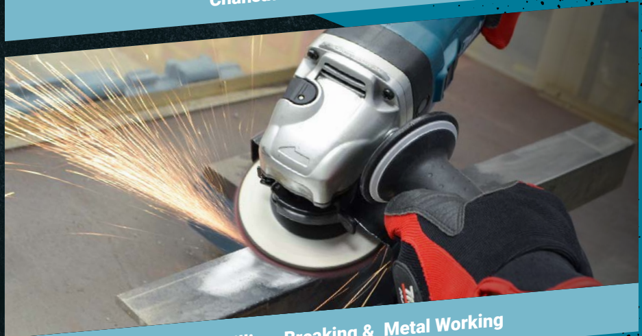
Hammer Drilling, Breaking & Metal Working