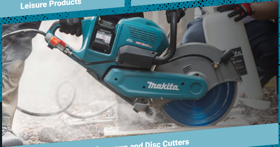
Chansaws and Disc Cutters