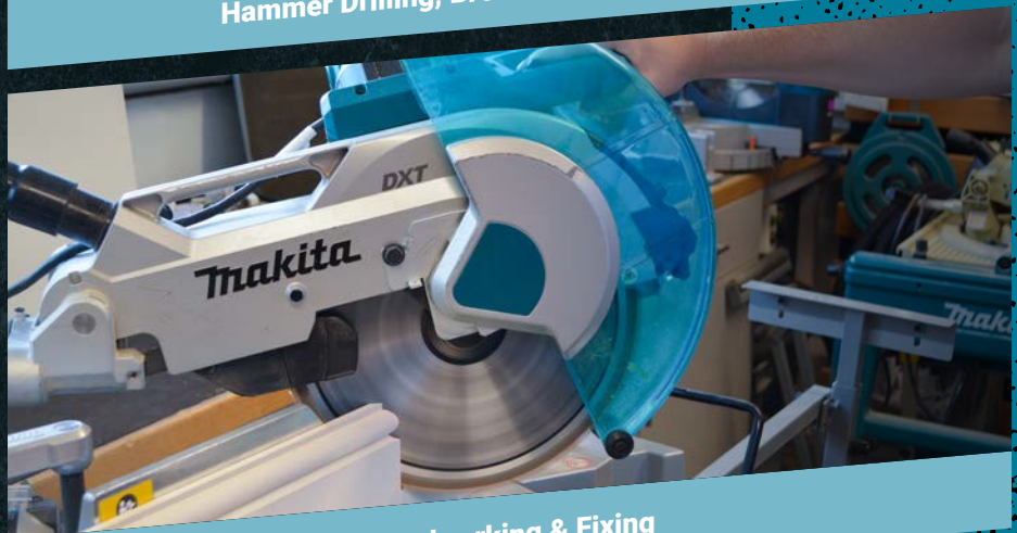
Woodworking & Fixing