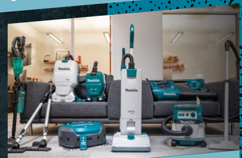
Facility Maintenance Products